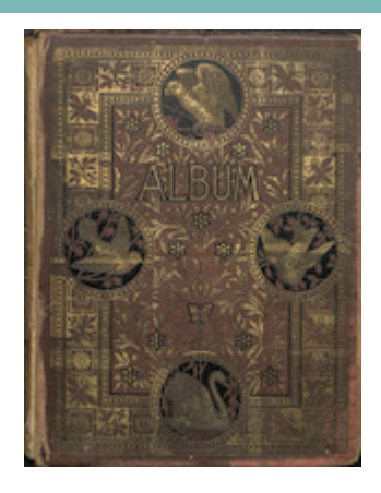
Series number 1