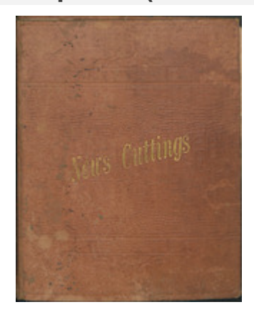
Unit ID 29689/3