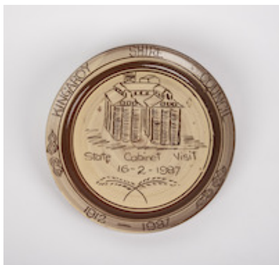
Plate (16 February 1987)