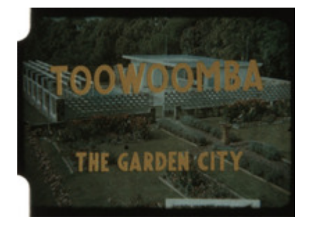
Unit ID 32845/10